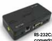
RS-232C/HDMI converter CBX-H11/1