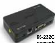
RS-232C/HDMI converter CBX-H11/1