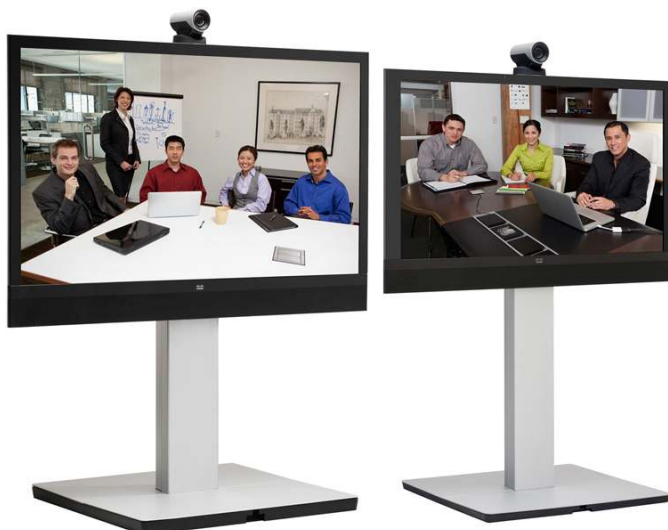
Figure 1. Cisco TelePresence MX300 and MX200 on Floor Stand

Installed in approximately 15 minutes, the Cisco TelePresence MX200 and MX300 endpoints reinvent the team meeting room experience. The systems offer the high-quality, easy-to-use telepresence experience that you have come to expect from Cisco, combined with simple installation, global service, and a price performance that makes broad deployment easier and more affordable than ever.