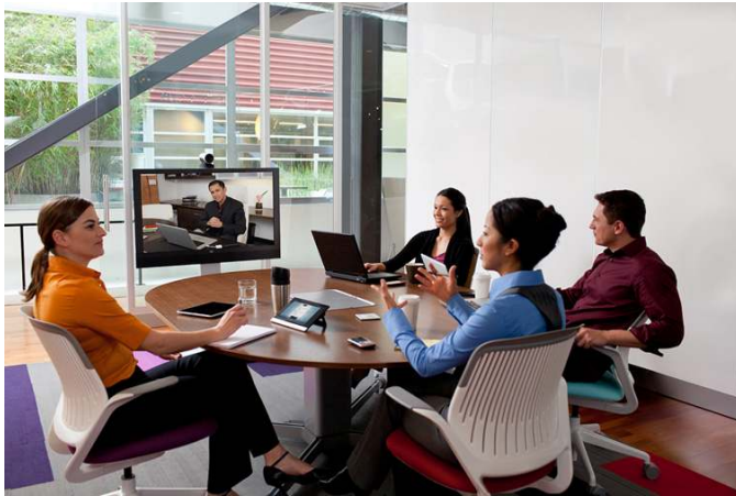
Figure 3. Cisco TelePresence MX300 in Medium Team Room Environment